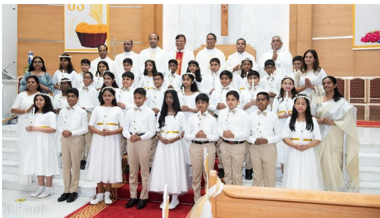
First Holy Communion-2023 Third Batch