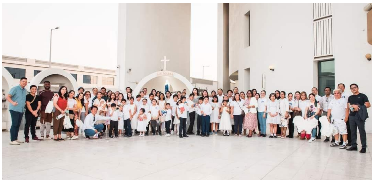
May Flower Devotion Celebration held on 27-May-2023