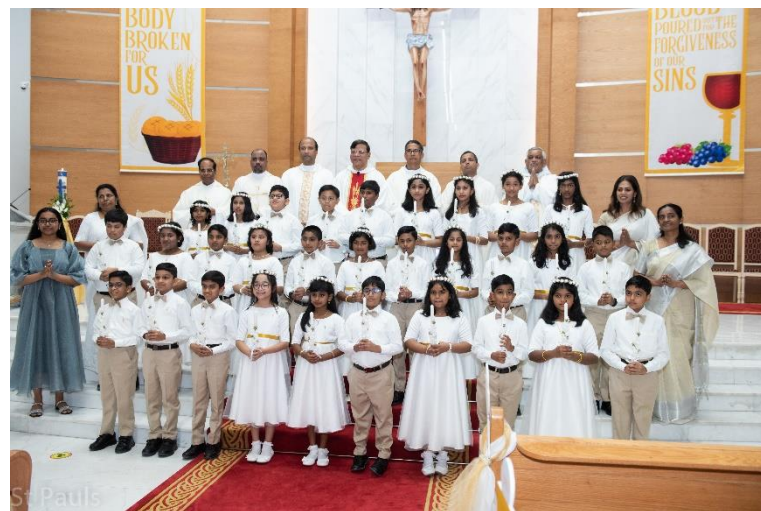
First Holy Communion-2023 First Batch