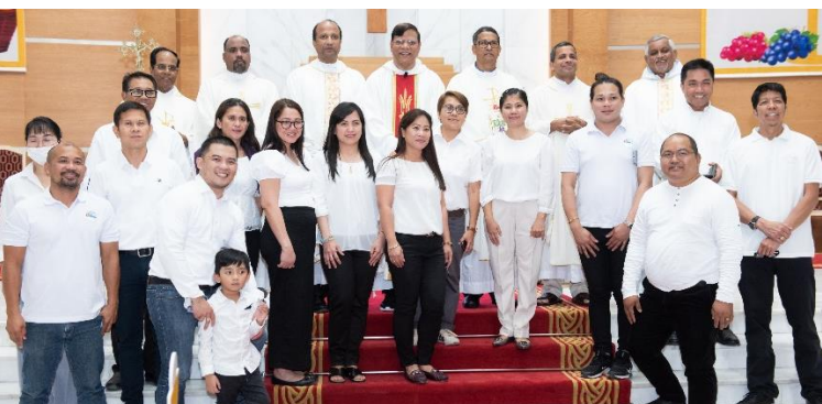
Choir during the First Holy Communion Mass