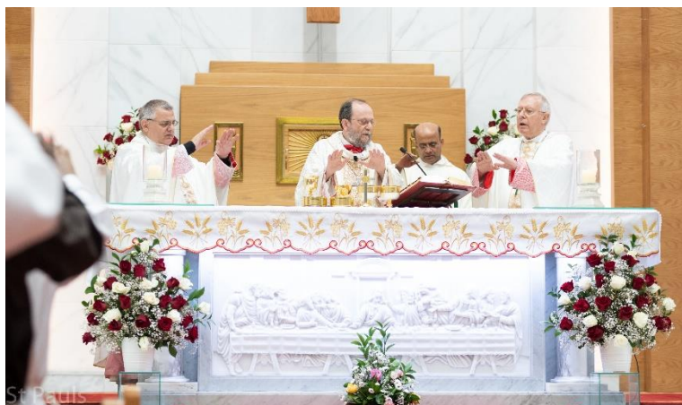
Capuchin Chapter Day-2, 09-May-2023