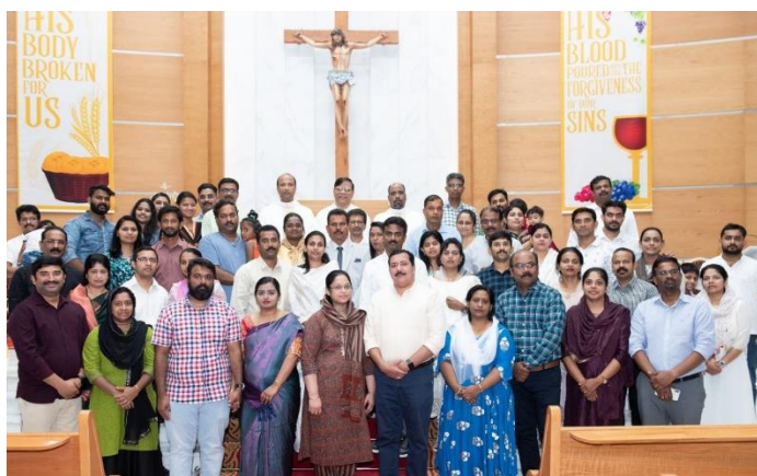
Wedding Anniversary Mass during the month of May-2023