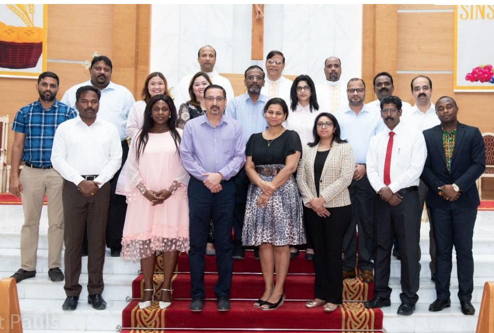
Newly Elected Parish Council Members