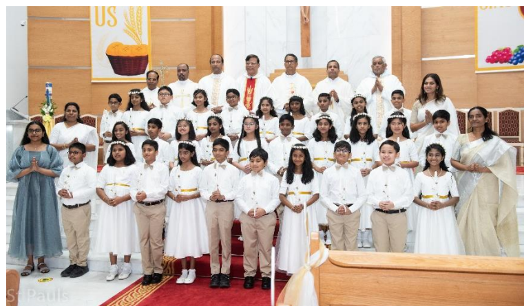
First Holy Communion-2023 Second Batch