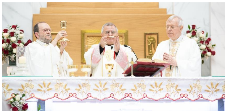
Capuchin Chapter Day -1, 08-May-2023