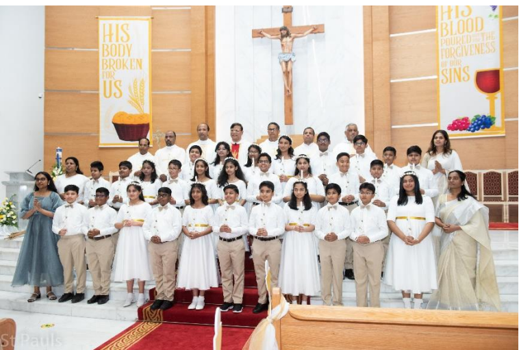
First Holy Communion-2023 Fourth Batch