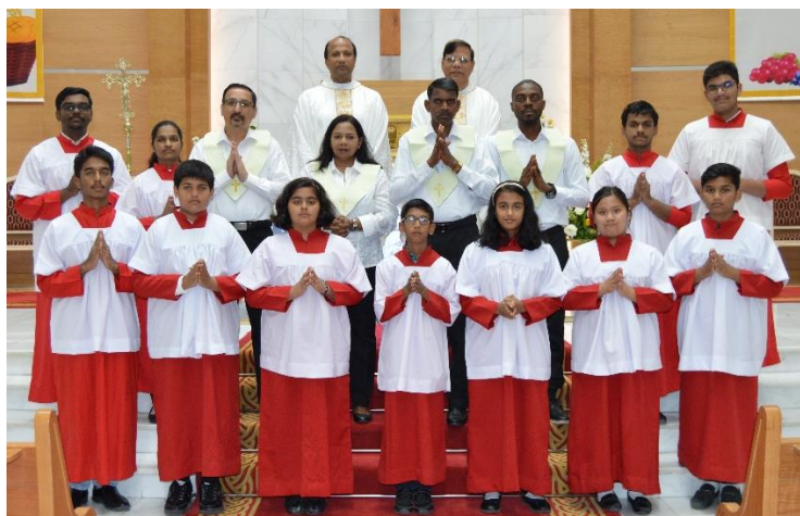
Altar Servers and Communion Ministers Reinstallation 25-May-2023